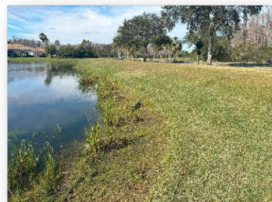
The mix of the three beneficial plants were planted along the residential property side of E3.

REPORT MIDGE, STORMWATER POND OR VENEZIA/ BELLA VIANA TUNNEL MAINTENANCE CONCERNS TO IMAN SAKALLA AT (407) 841-5524 EXT. 147 OR ISAKALLA@GMSFCFL.COM